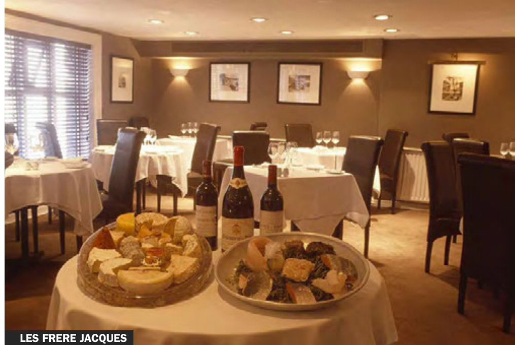
LES FRERE JACQUES

the 1950s. 12 Fleet Street, Dublin 2. Tel: 00 353 1 671 7777. www.hardrock.com