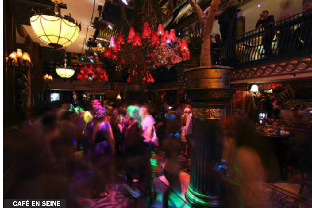
CAFÉ EN SEINE

and singalongs are the norm. 24-25 Temple Bar, Dublin 2. Tel: 00 353 1 677 0527. www.thesmithgroup.ie/aulddubliner